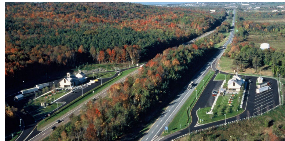
Typical US highway rest area