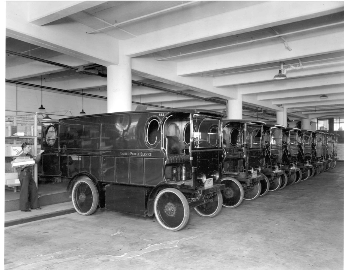
1936 UPS electric cars