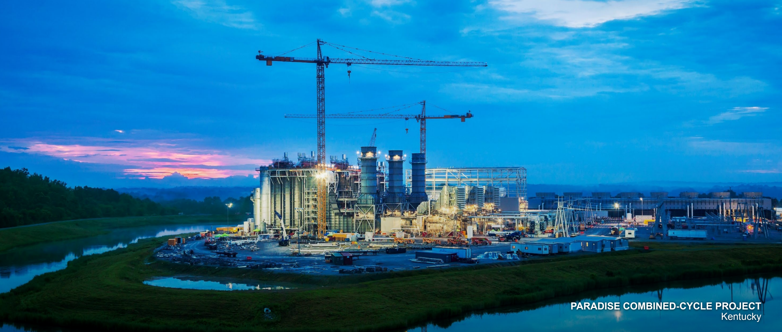
PARADISE COMBINED-CYCLE PROJECT Kentucky